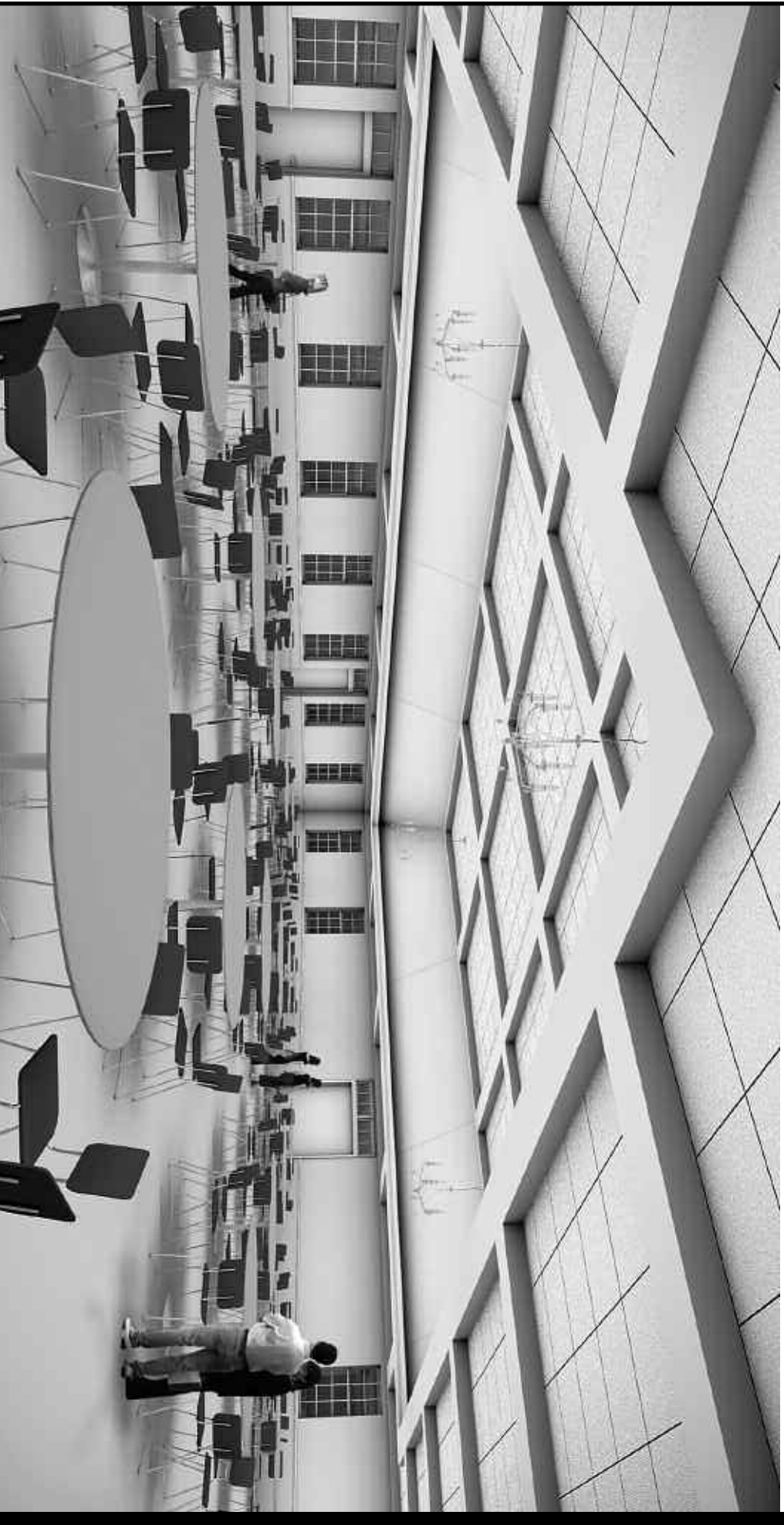
Rendering is for illustration purposes only. Does not reflect details of final design, particularly with regards to the church entrance.