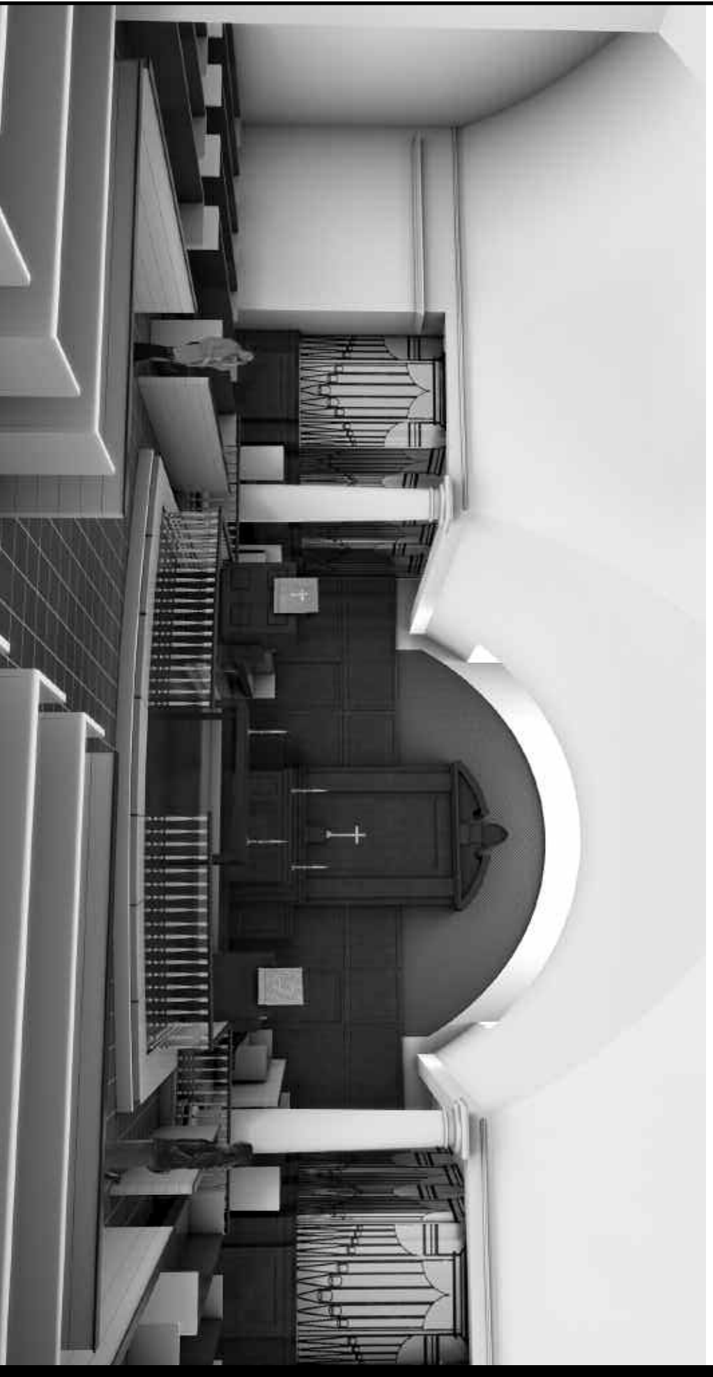
Rendering is for illustration purposes only. Does not reflect details of final design, particularly with regards to the church entrance.